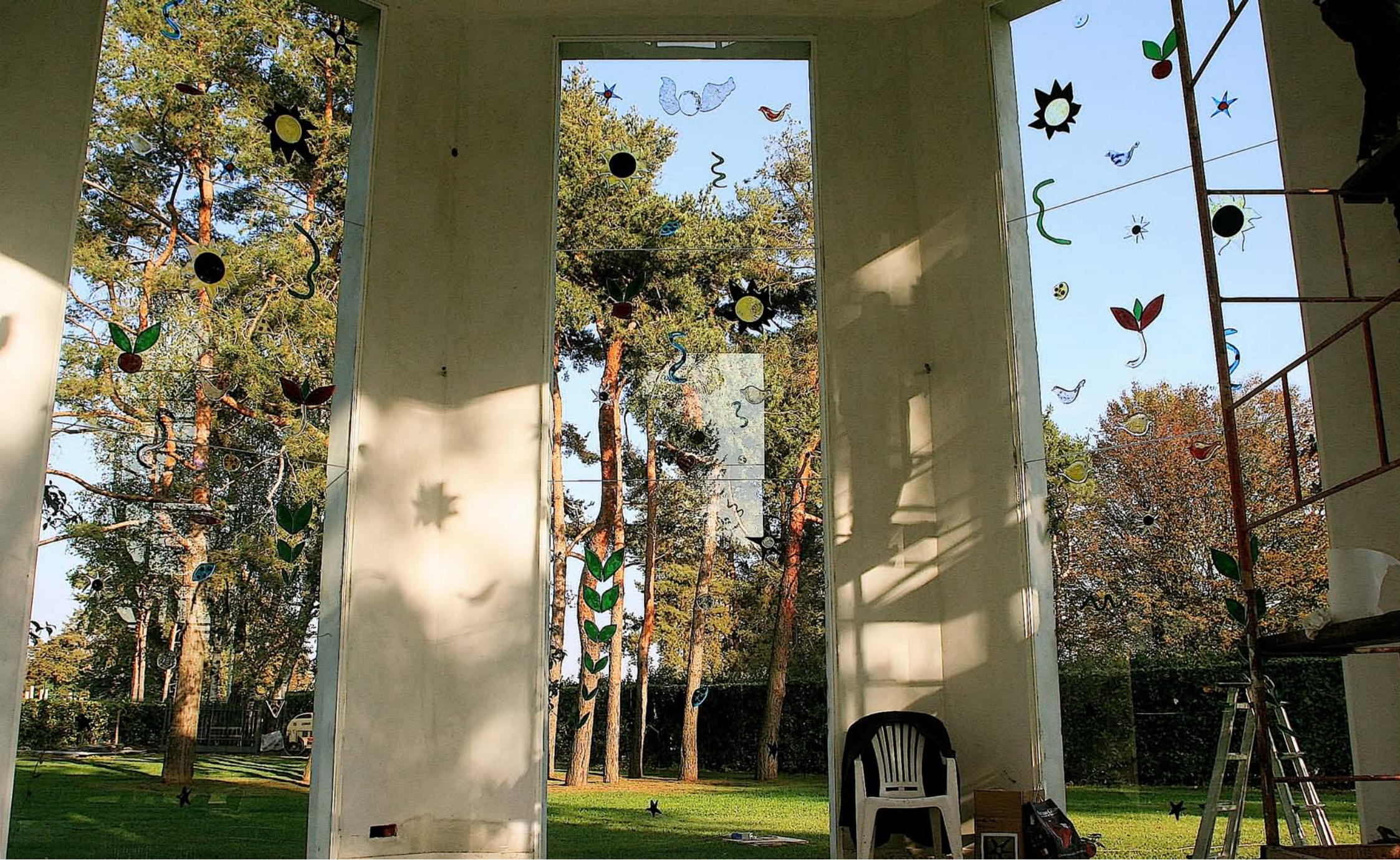
INSTALLING THE WINDOWS' ELEMENTS