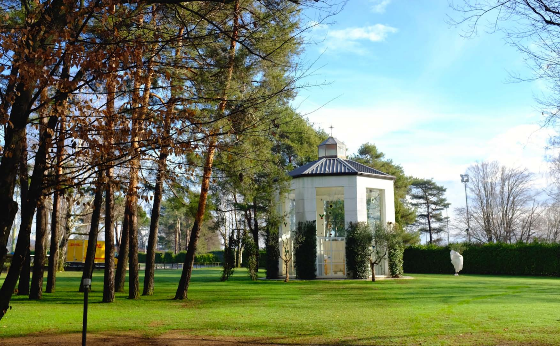
INTER FC CHAPEL, APPIANO GENTILE, ITALY